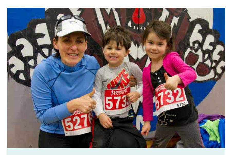
Ottawa Physio Race participants