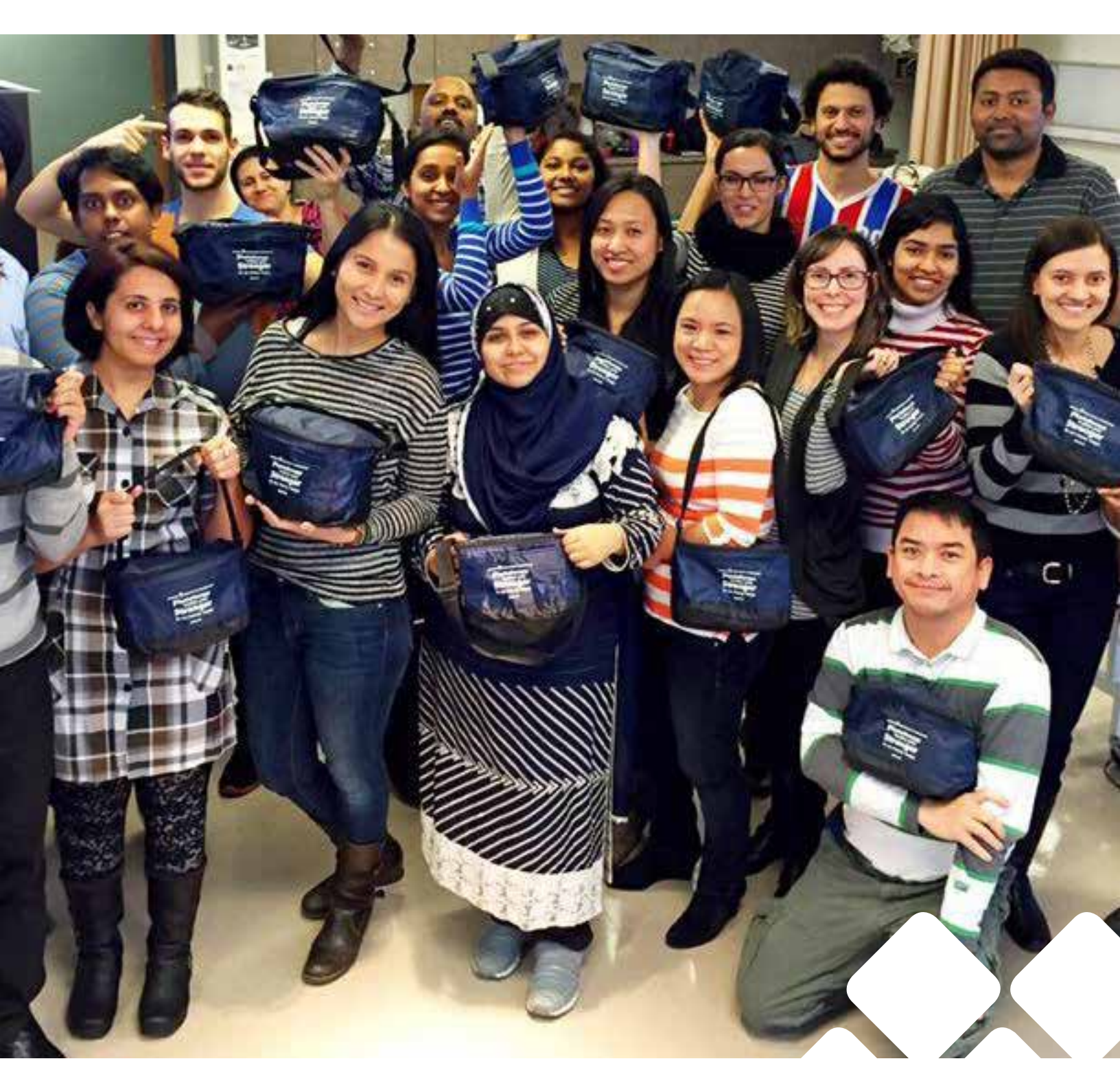
Students in the Ontario Internationally Educated Physical Therapy Bridging (OIEPB) Program with OPA lunch bags

Ontarians are healthier and stronger through physiotherapy